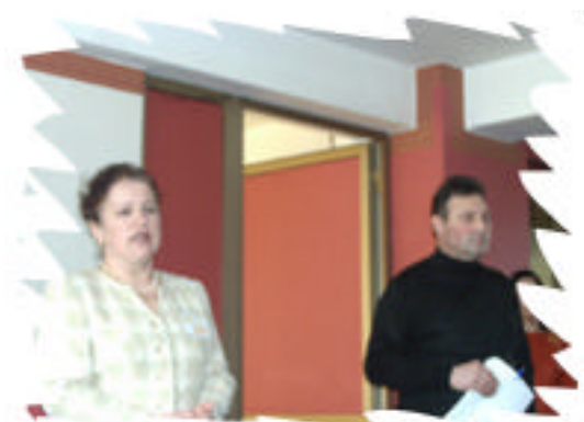
1% campaign initiated in Constanta

The activities of the project were developed in the counties of Constanta, Iasi and Mures. Following our information campaign the public was correctly informed on the achievements of Holt Romania Foundation and on their legal right to support the activity of a non-profit entity by redirecting part of their income tax.