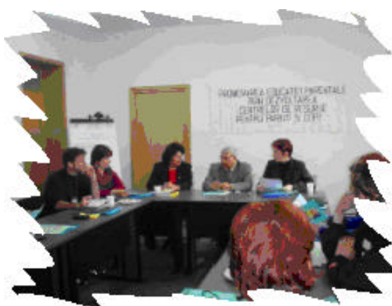
Constanta – Prahova

✍ 190 children and 161 parents participated in 8 Special Events organized on the occasion of March 8 – Mother's Day, Easter, International Child's Day, Beginning of a New School Year and Christmas;