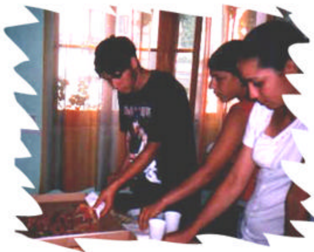
June 2005 together with the groups of siblings