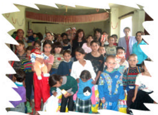
June 1st - Mures