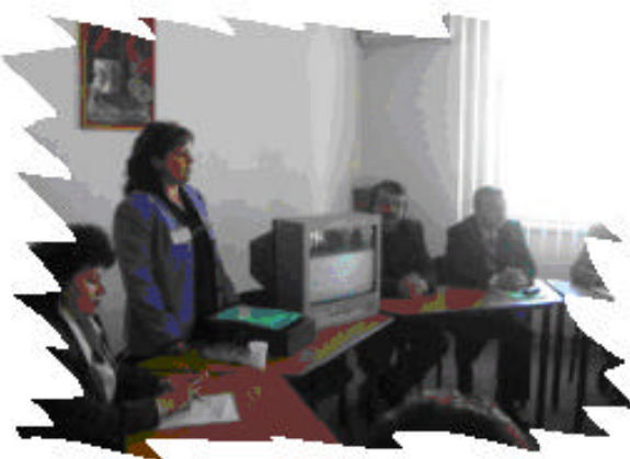
Constanta – Ialomita