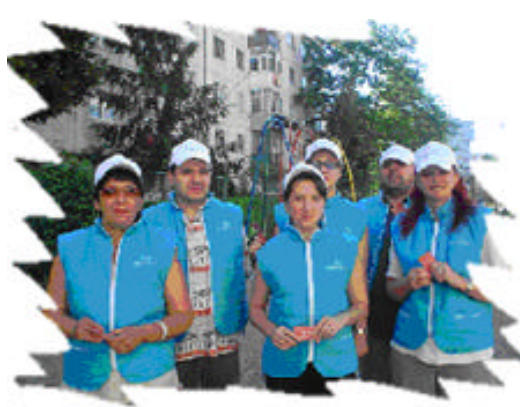
1% campaign in Iasi