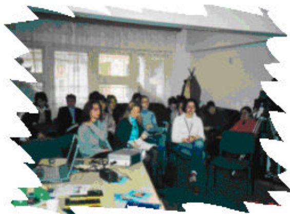
Mures - Bistrita