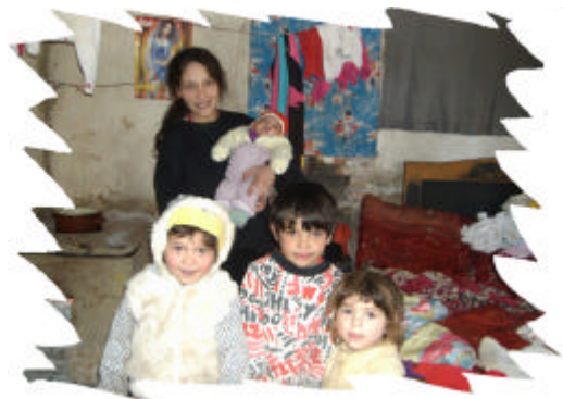
Children and families assisted by Holt Romania