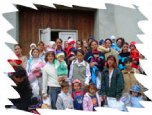
June 1st - Iasi

? 1051 children and 598 mothers benefited from the Welcome Baby component in the maternities of Medgidia, Iasi, Constanta, Targu Mures, Bucuresti, Bistrita, Slobozia, Ploiesti, and Bacau. The new mothers were visited by a Holt specialist, had a first discussion of the challenges of being a parent and received a special bag with informational and educational materials and clothes for the child.