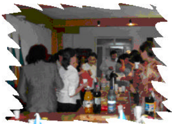
June 1st – Cumpana