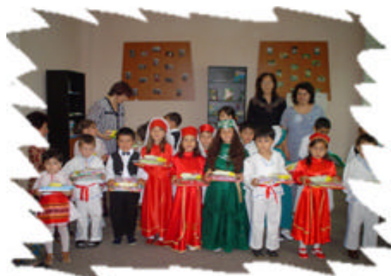
June 1st - Medgidia