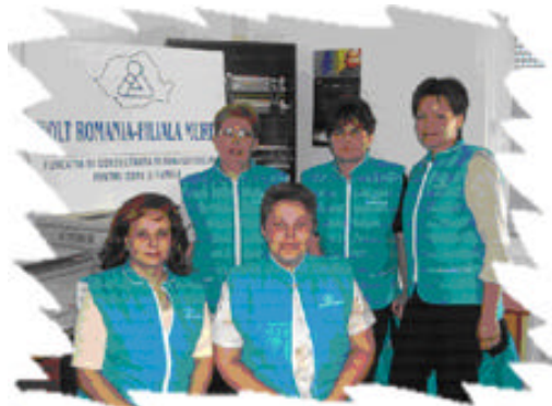
1% campaign in Mures