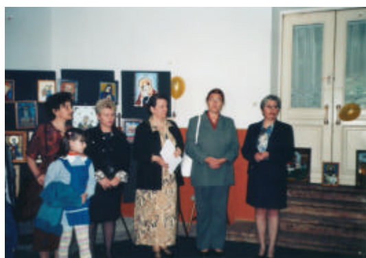
May 27, 2004 Mures – Sale Exhibition of Icons Painted on Glass