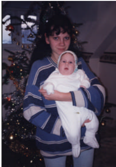
One mother beneficiary of Shelter in Bucharest

On December 1 st 2004 the Center for Mother and Child Bucharest of Holt Romania – FCSSCF (Maternal Center) inside the Social Services Complex “ Saint Ecaterina ” was totally transferred to the General Directorate of Social Assistance and Child Protection Bucharest Sector no. 1 which took over both the existing equipment, as well as its specialized staff.