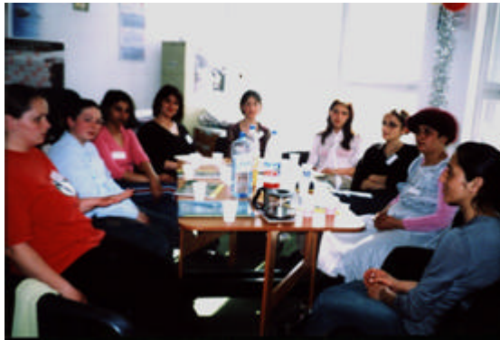
Courses "How To Become Better Parents"