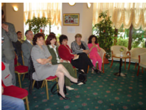
May 31 st , 2004 – Hotel Savoy, Mamaia

was raising funds for children coming from poor families in this county, assisted by the organization. This action took place on May 31 st , 2004 inside Hotel Savoy – Mamaia. The total sum raised was of 28.200.000 lei (850USD) from which we bought toys and sweets for 40 children to enjoy the holiday spirit.