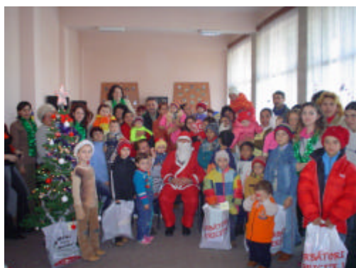
Christmas Party - Medgidia

On CHRISTMAS 2004 , Holt Romania team offered presents to children assisted through the sponsorship/crisis intervention program following a fund-raising campaign "To Support Our Children" organized in this period. Due to some wonderful people in Constanta community we raised 44.400.000 lei (1.530 USD). The poor children enjoyed receiving some unexpected gifts on Christmas Eve. Parties were organized around the Christmas Tree both in Constanta and in the other Holt branches.