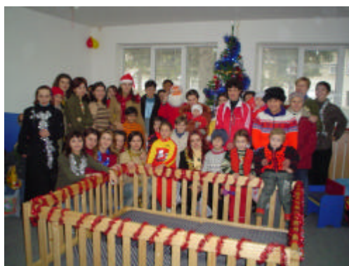
Christmas Party - Iasi