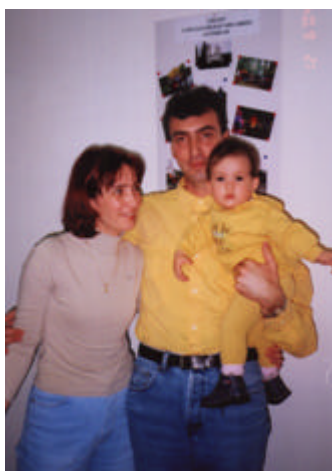
Adoptive families and adopted children with Holt Foundation support