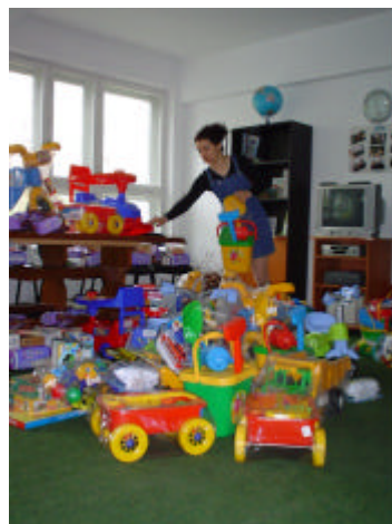
Toys – June 1 st , 2004