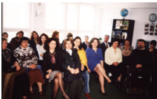
UNICEF Conference October 2003

✍ 40 representatives of the local authorities involved in Child Protection in the Counties of Braila, Salaj, Giurgiu and Suceava were theoretically and practically trained.