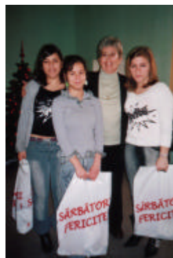
Christmas 2004 together with the groups of siblings in the Lift program