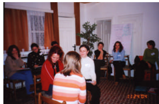
Photos taken during the training session November 23-26, 2004