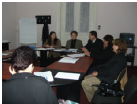
Meeting with a Specialist

✍ 236 parents participated at Meetings with various Specialists , a number of 564 children being impacted.