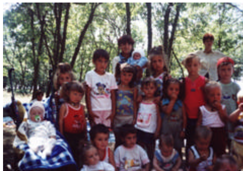
June 1 st , International Child's Day

✍ 137 children and 92 families participated at Special Events organized on the occasion of the 8 th of March, Easter Holidays, June 1 st - International Child's Day and Christmas;